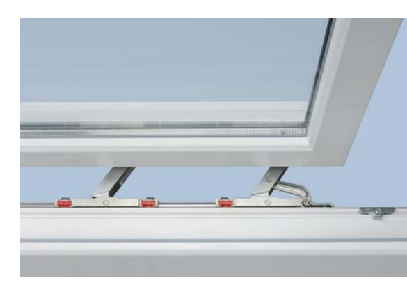
New Roto Patio Z heavy-duty bogie with integrated anti-jemmy device